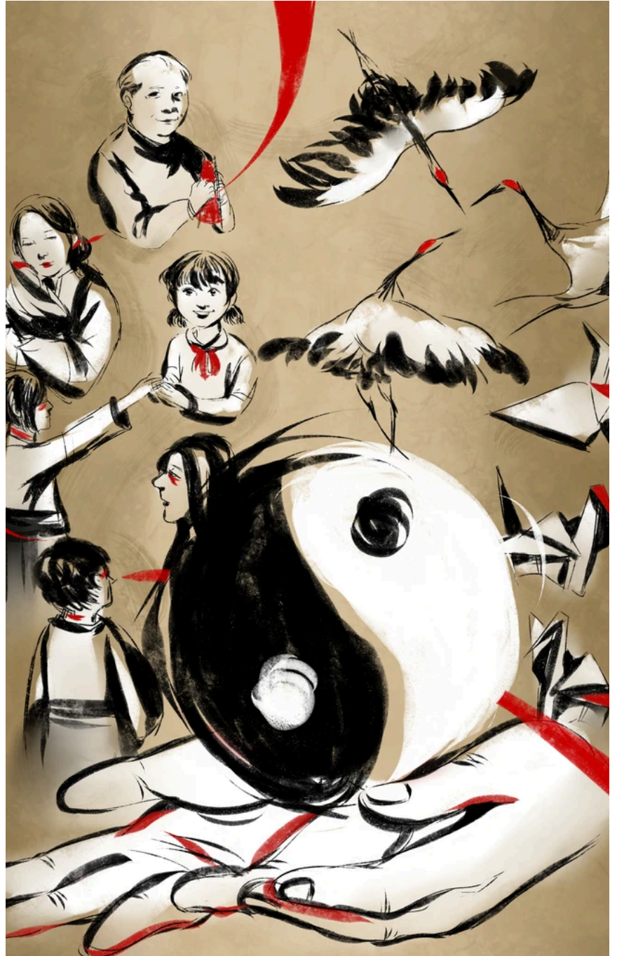
Together Toward Peace (2019), Angel Xing, ALPHA Ed. History+Art=Peace